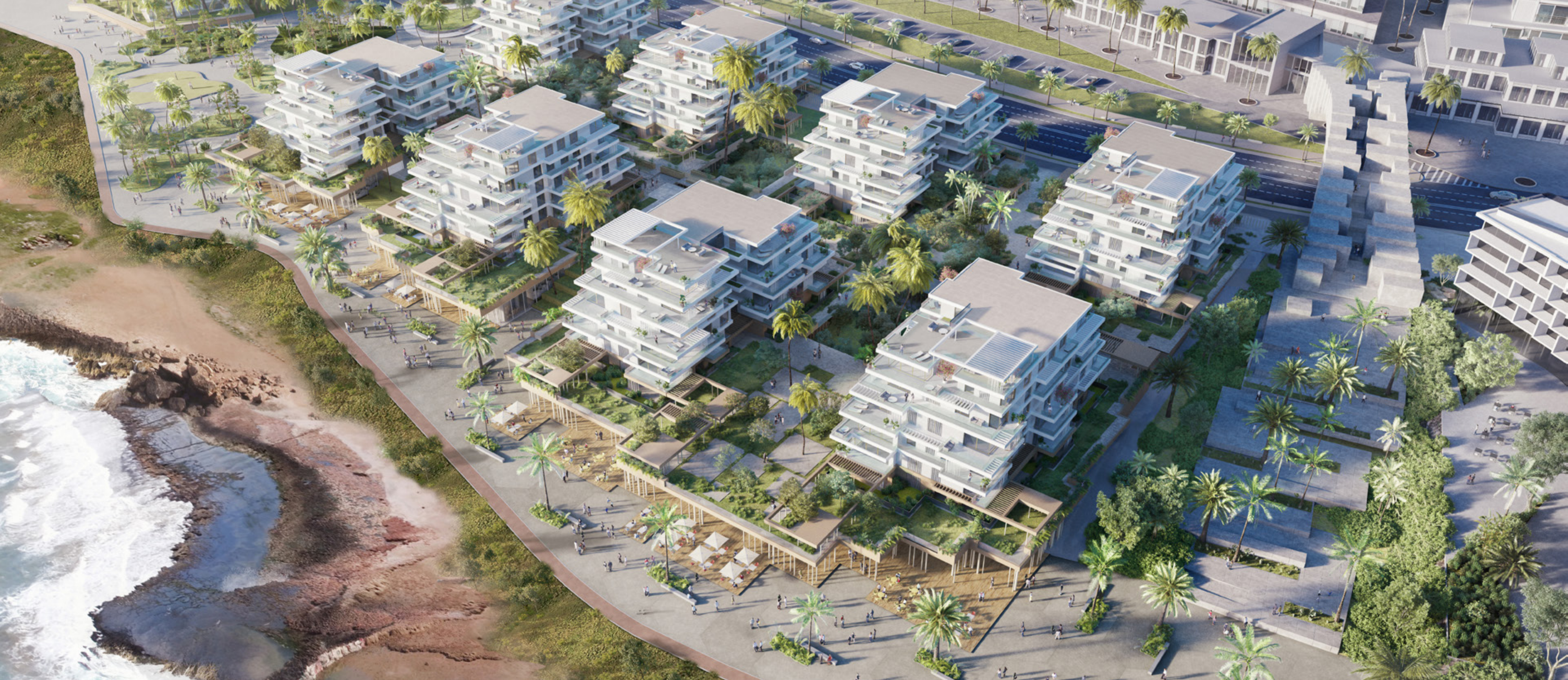
Waterfront Promenade, welcoming green pedestrian promenade.

All images used are for illustrative purposes only and do not represent the actual size, features, specifications, fittings, and furnishings.