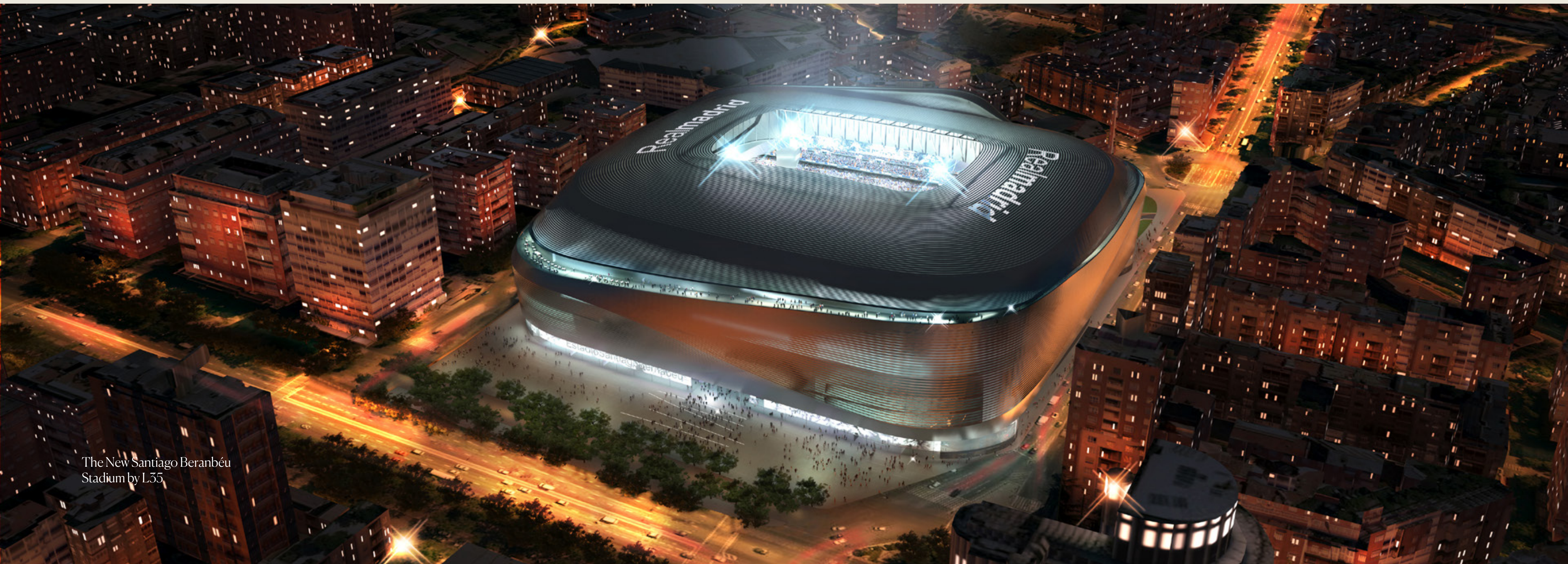
The New Santiago Bernabéu Stadium by L35